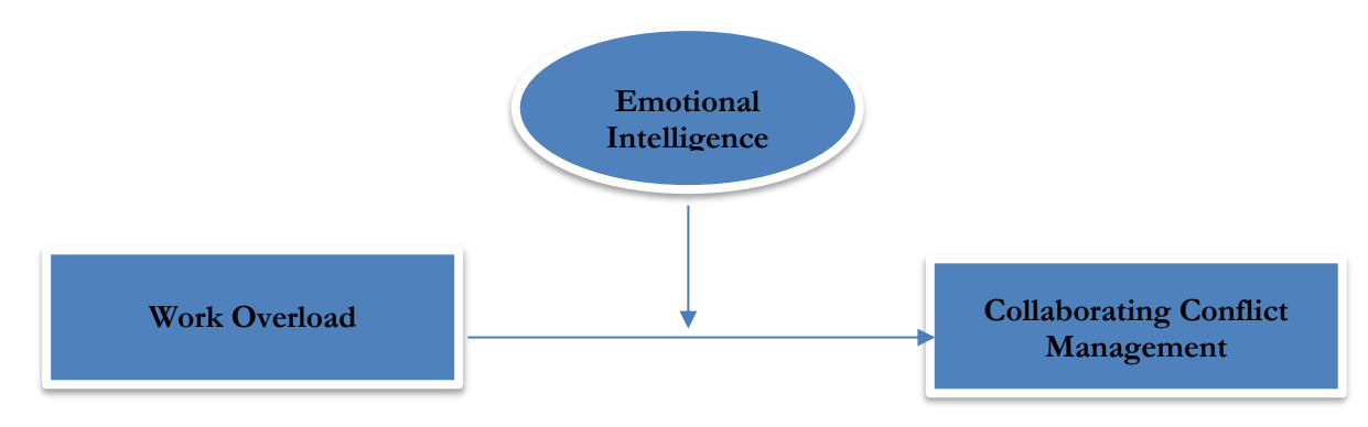
Figure 1: Conceptual diagram of Study Variables