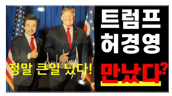
Figure 4: Huh's meeting with Donald Trump