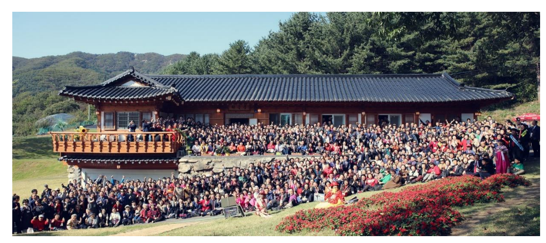
Figure 5: followers of Huh at Haneulgung

private protection.<sup>xiv</sup> Huh promoted less political issue except the suggestion of MP's number from 300 to 100 for cost reduction as well as the abolition of provincial elections.<sup>xv</sup> He did not support the national party system, which he considered to frequently cause political quarrels. To decrease internal tensions, a reduction from eight to four provinces of Korea has been also suggested. While these policies were extreme ideas beyond the general understanding of the people, the conscription of the military service was welcomed by young men.<sup>xvi</sup>