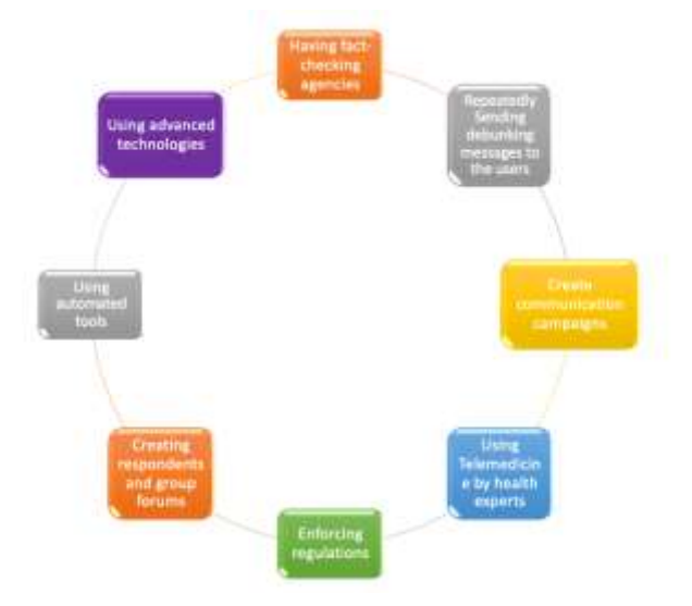
Figure 3: Proposed solutions for decreasing the spread of fake news

The solutions proposed for defeating the spread of fake news on social media are summarized in Figure 3.