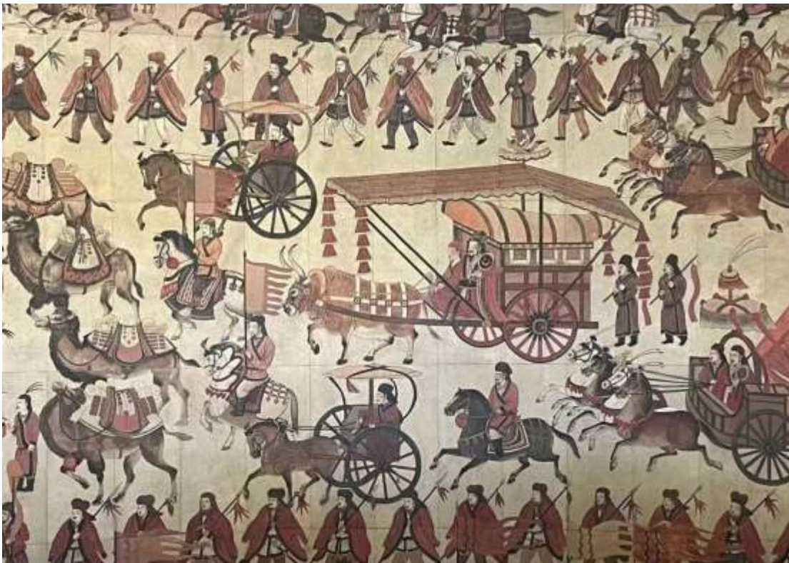
Figure 3. Tao ox cart and ancient paintings.

Natural science museums focus on animals, plants, geology, paleontology and anthropology, showing the origin and evolution of ancient creatures ( Yang Junqing,2022). Exhibition and exhibitions are usually systematic and sequential. For example, the Liaoning Paleontology Museum combines the mammoth skeleton with the