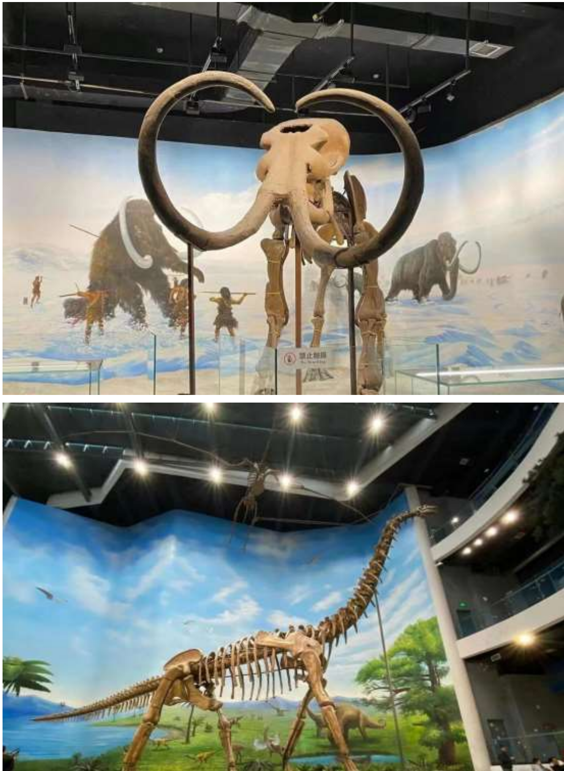
Figure 4. Ancient biological diagram.