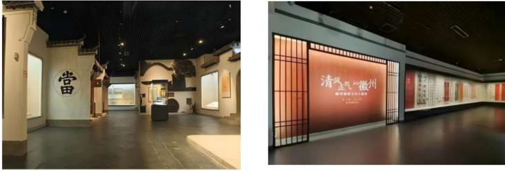
Figure 6. Features of the Hui-style architecture.