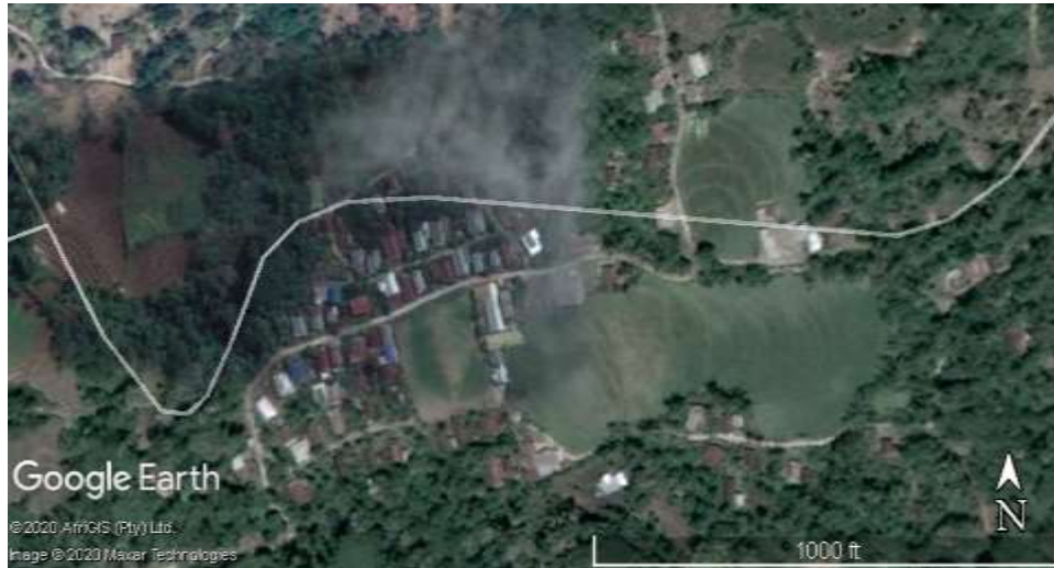
Figure 2. Distribution Map

From figure (2) above, it can be seen that the Kaluppini area is in the form of mountains or plateaus with rough relief, thus forming a clustered settlement pattern that follows the road. This pattern is also caused by the majority of the population working in the agricultural sector and located close to residential areas to make it easier for them to approach transportation facilities.