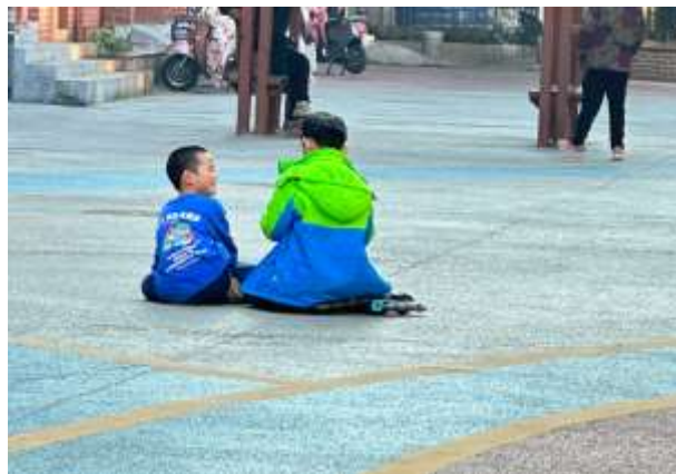
Figure 5: Interaction between Children.

It is clear from the participant observation and interview data that the street environment plays a diverse role in the development of children's learning behaviours. Observations showed that children often explored spontaneously on the street and that they were curious about new things. This exploratory behaviour extended beyond the school classroom. For instance, Boy B2 talked in his interview about how he observed different leaf shapes on the road and discussed with his friends where these leaves might have come from (as shown in Figure 5), which also reinforced social interactions with peers. As girl G3 shared the fastest route to walk to school. Children were able to improve their navigation skills through interactive play, which enhanced problem-solving skills and teamwork.