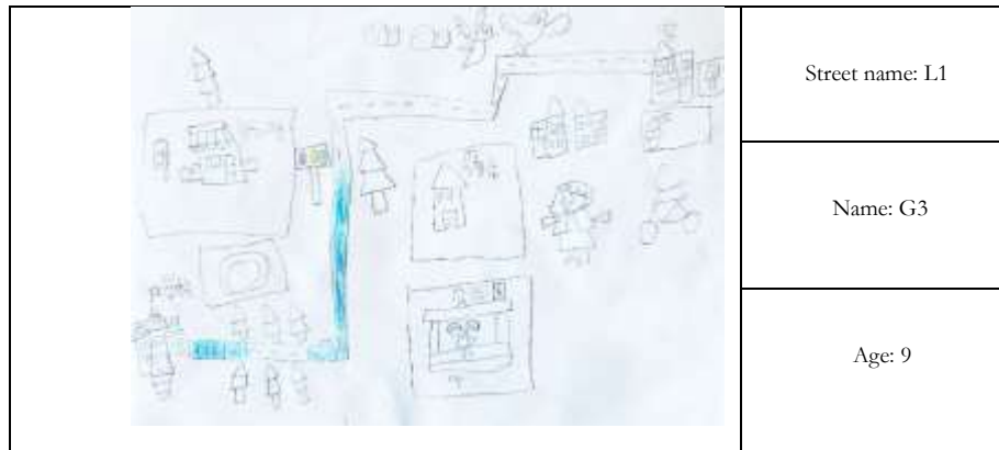
Table 6: G3’s Drawing.

safety measures. G3 uses a lot of red and green in her drawing, which not only attracts the eye, but also symbolises stop and go signals, showing the children’s understanding of traffic rules. These features significantly enhance children’s perceived safety on the streets.