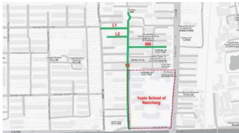
Figure 2: Research Streets in Nanchang City.

Based on these criteria, the three streets selected for this study are Yuxin Street, Living Quarters Street 1, and Pingan Neighborhood Inner Street I (See Figure 2).