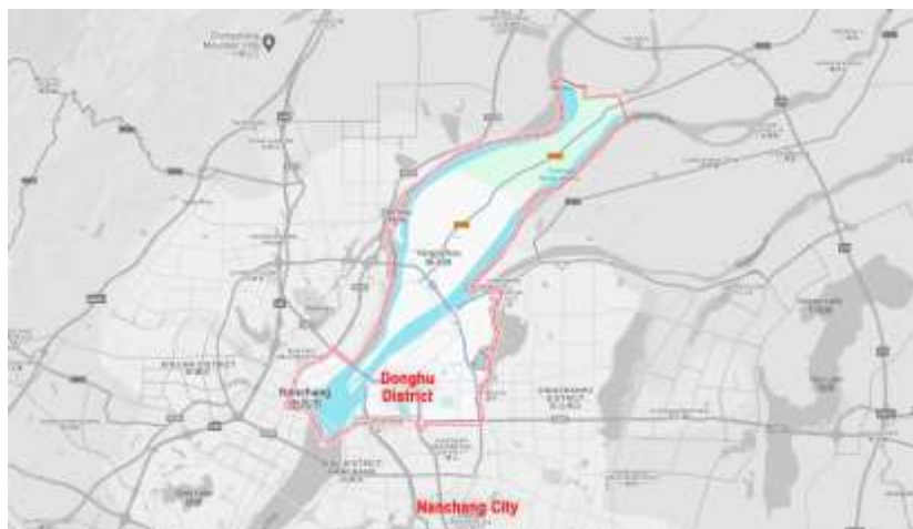
Figure 1: Nanchang City Map.

Nanchang City, Jiangxi Province, China, was chosen as the case study site for this study because, as a rapidly developing provincial capital city in eastern China, it has made significant progress and positive practices in urban planning and the construction of child-friendly spaces in recent years (a map of Nanchang City is shown in Figure 1).