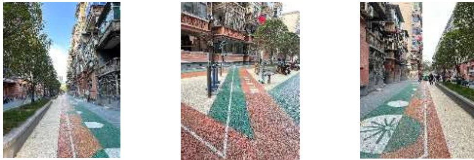
Figure 4: Educational Playground.

Design elements play a vital role in creating attractive street environments, especially for children, as they not only enrich their daily experience but also become an important part of their learning and exploration. Observations have shown that design elements such as art walls, interactive signage, educational playground graphics, murals or sculptures of regional cultures are more likely to attract children’s attention. These elements are often placed where children can easily access and interact with them, which not only encourages their curiosity, but also promotes their knowledge and understanding of the world around them. A prominent example of this is the educational playground graphic displayed in Figure 4. This colourful floor covering engages children with its vibrant colours and engaging design. Children usually stop to observe these drawings, discuss their content, and even play on them. This not only provides a space for play, but also subconsciously teaches children about colours, shapes, numbers, or letters.