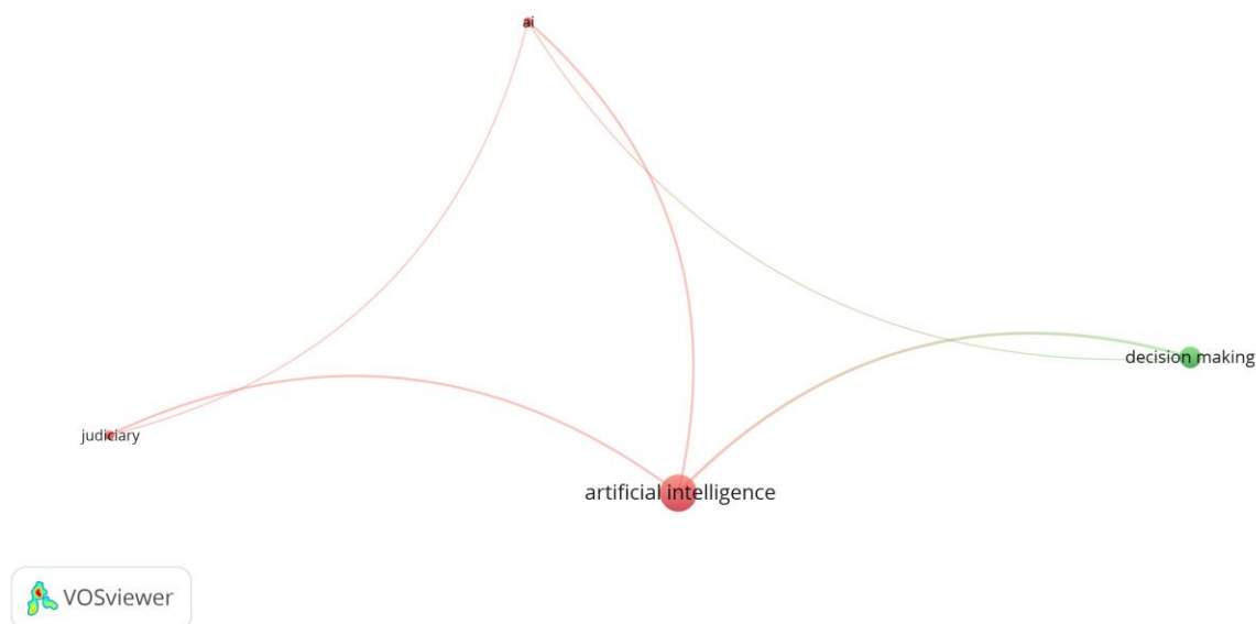
Figure 2. Co-occurrence of keywords.

Figure 2 shows the relationship between the keywords used to search for the study material for the systematic analysis proposed for this research.