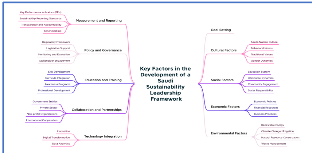
(Figure 3) Factors for the Development of a Saudi Sustainability Leadership Framework

Here are some strategies and approaches that can be adopted: