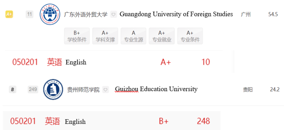
Figure 4.2. Rankings of English majors at two universities in China in 2021.

However, the level of English majors at GEU was B+, ranking No. 248 among the universities in China. It shows the level gap between the English majors in the two universities. Hence, the textbook suitable for English majors at GDUSF may need to be adapted to meet the language proficiency of English majors at GEU.