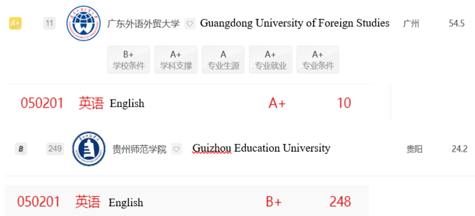
Figure 4.2. Rankings of English majors at two universities in China in 2021.

2021. The level of English majors at GDUFs was A+, ranking No. 10 among the universities in China. However, the level of English majors at GEU was B+, ranking No. 248 among the universities in China. It shows the level gap between the English majors in the two universities. Hence, the textbook suitable for English majors at GDUFs may need to be adapted to meet the language proficiency of English majors at GEU.