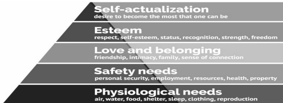
Figure 1: Maslow’s Hierarchy of Need Theory

This study relies on Maslow's Hierarchy of Needs theory, introduced by Abraham Maslow in 1943. The theory posits that people have varying levels of needs that ought to be fulfilled in a specific sequence, with lower-level needs taking priority over higher ones. However, Maslow himself suggested that this sequence is not rigid, therefore, the needs change differ from one person to another due to their preferences or choices. This theory is relevant in this study because the study seeks to explore voting behaviour, influence, and choices. The study uses the theory to understand “what is the motivation behind”, “how people vote” and “why people vote”. Figure 1 below depicts a pyramid of the hierarchy of needs at the bottom and higher-order needs at the top.