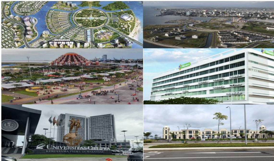
Figure1: Center Point of Indonesia (CPI) Area and Business District

The establishment of this monumental area has several key objectives. Firstly, it serves as a coastal mitigation effort to prevent disasters such as tsunamis, tidal floods (ROB), sedimentation, and abrasion. Secondly, it supports the South Sulawesi government's "Go Green" program by achieving more than 47 percent green open space (RTH). Thirdly, it accelerates the formation of a New City Development (Integrated Global Business Area) and accumulates local culture and history. Lastly, it functions as a form of reclamation and Integrated Coastal Zone Management (ICZM).