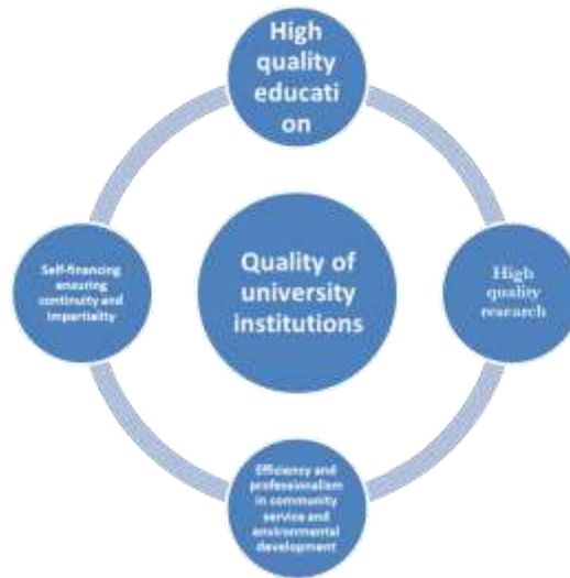
Figure (2) Elements of achieving quality in university institutions

The researcher will address the elements necessary to achieve quality according to the definitions and theoretical frameworks previously presented, as we will address the following elements Shown in Figure No.