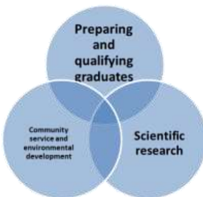
Figure (1) Elements of quality in university institutions

We can identify quality elements in university institutions A set of interconnected elements, as shown in the following figure (1):