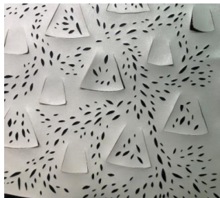
Figures.19 Embroidered bottom of PU synthetic leather