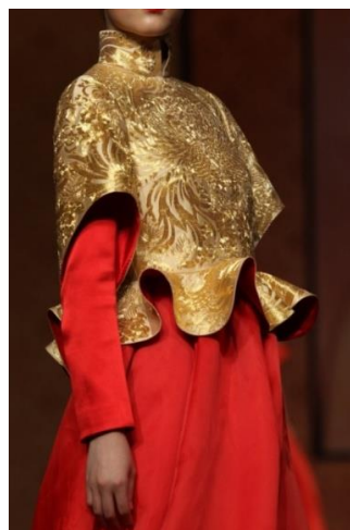
Figure .13 Netiger's "Mingli" Haute Couture Costume

On September 30, 2019, HEAVEN GAIA, a Chinese high-end women's clothing brand, released the Spring/Summer 2020 series theme show with the theme of "Harmony" at the Little Palace Museum in Paris. This museum is open to Chinese designers for the first time. Among them, Youlong series uses the combination of Chinese and western silhouettes, and uses aesthetic art to "hide" traditional totems in the cuffs, backs and hem of clothing, and integrates dragon shapes into clothing. The strong contrast with the black gold thread embroidery process reflects the grandeur and magnificence of this garment, and at the same time, it contains full national strength. (Figure.12)