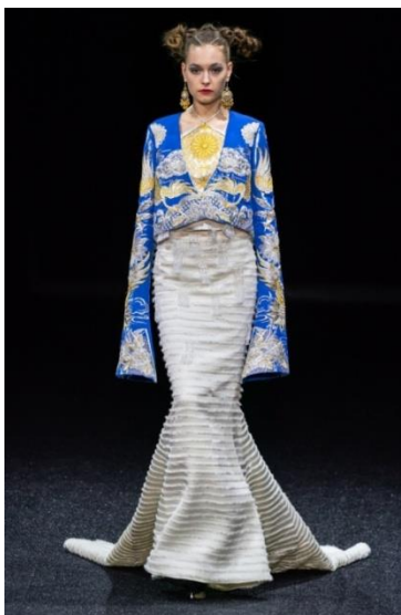
Figure.14 Guopei Spring/Summer 2019 Collection

On October 25th, 2014, China's high-end fashion brand NE•TIGER "Mingli" haute couture clothing conference was held in Beijing Hotel. The brand Chinese elements lit the torch of Chinese costume civilization. In one of the high-definition clothing crafts, the gold-nailing embroidery method is applied to the whole pattern, and the exquisite radian achieves the effect of highly natural curving. At the same time, the tiny fine threads and some special textures of the pattern are represented by the extremely fine split threads, showing the lifelike and elegant and gorgeous picture, which has both national customs and the beautiful effect of international fashion atmosphere (Figure.13).