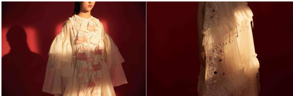
Figure.23 Demonstration of innovative practice of gold embroidery

5.The physical display of innovative practical clothing with gold embroidery (Figure.23 and Figure.24).