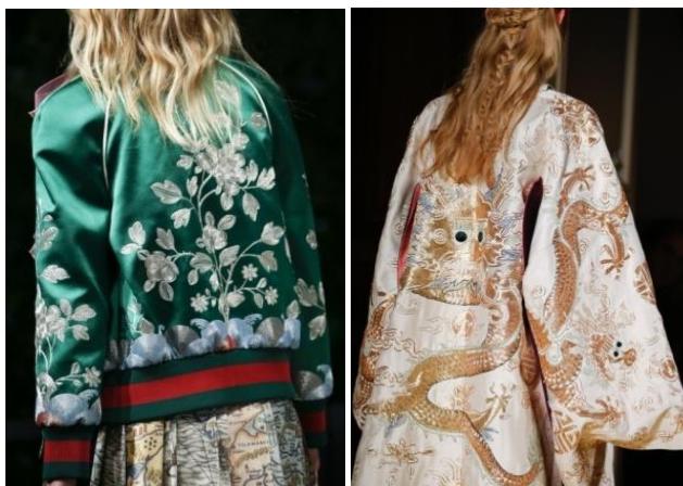
Figure.10 Gucci Spring/Summer 2016 Collection