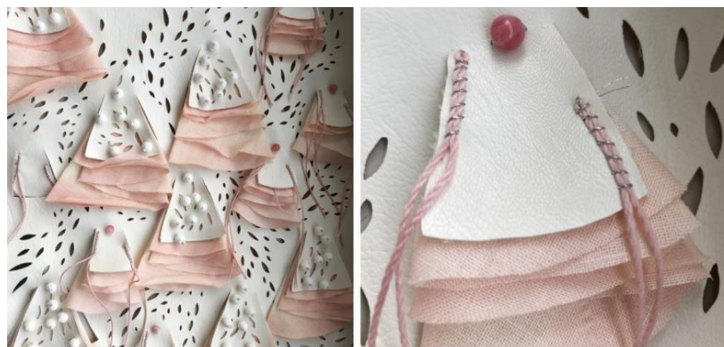
Fig.21: The pattern designed by sewing thread with PU synthetic leather as the embroidery base combined with hollowing, beading and beading

In the teaching process, the author has led a team of students to try to innovate the gold embroidery process. There are two kinds of commonly used gold embroidery methods: open stitch and concealed stitch (Li,2015). The former stitch is exposed on the thread stem, while the latter is hidden in the thread stem. In practice, double cotton thread with a diameter of 1.2mm (Figure.15) is used as the main thread, three polyester colored threads with a diameter of 0.2mm (Figure.16) are used as the fixed thread, and hollow beads, bead tubes, artificial gem, hot drilling, hematoxylin dyeing (Figure.17) and ( Figure.18) are used as auxiliary materials for embroidery. TPU and PU synthetic leather are used for the embroidery bottom. (Figures.19 and 20)