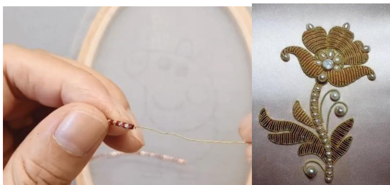
Figure.5: Fine copper wire is inserted into Indian wire to make it firm, so that various shapes and curves can be molded.

Nail embroidery technology is simple and rich in decorative effect, which belongs to one of the common embroidery decorative techniques in traditional costumes. Embroidery thread is made of many kinds of materials, such as cotton thread, hemp thread, wool thread, gold and silver thread, chemical fiber thread, silk thread and so on (Huang,2014, p. 152).