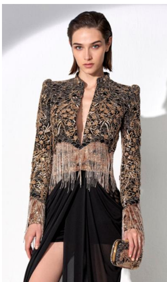
Figure.11 zuhair Murad's Early Fall 2019 Series

Gucci's spring/summer 2016 products used the gold embroidery process. (Figure.10) His works are inspired by the "Eight Treasures Lishui Pattern" in the official robes of the Qing Dynasty, and express a gorgeous and solemn visual decorative effect by using the traditional application technique of gold-nailing embroidery. Valentino (Valentino)' s 2016 Spring/Summer Gaoding Dragon Robe Cover uses the process of nail gold embroidery. Each stitch is vivid and vivid, and the classical luxury of Chinese style is vividly interpreted (Figure.11).