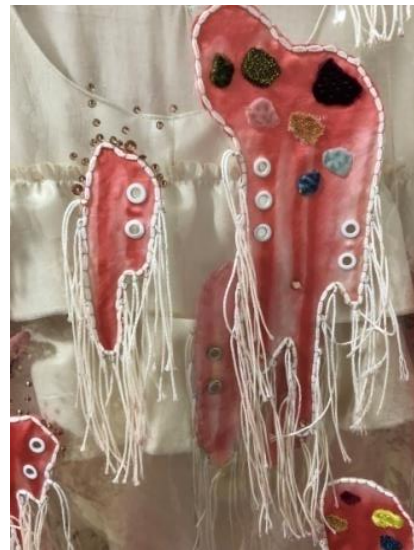
Fig.23: The pattern designed with TPU as the embroidery base by using the thread-stitching embroidery process combined with corn rivets, hot drilling and hematoxylin dyeing.