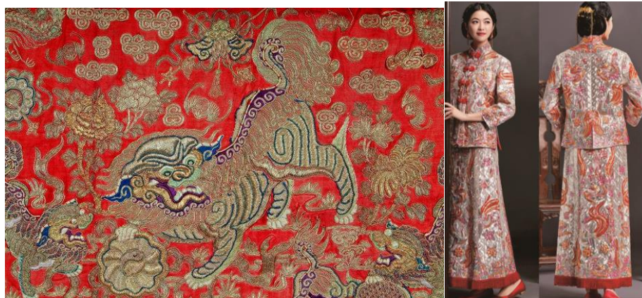
Figure.3: Partial details of table skirt cross ball