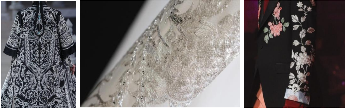
Figure.7: Application of Stitching Thread Embroidery in Satin Embroidery Bottom