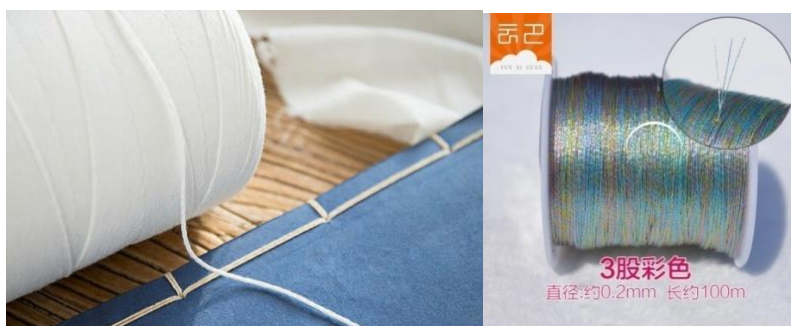
Figure.15 Three strands of cotton thread with diameter of 1.2mm

When we understand the inheritance of folk handicrafts and study the inheritance relationship of folk handicrafts, we should pay attention to those inheritance forms that hold a "positive" attitude towards tradition, but we should not ignore all kinds of trends that try to develop, adapt or reinterpret tradition (Yang,2004).