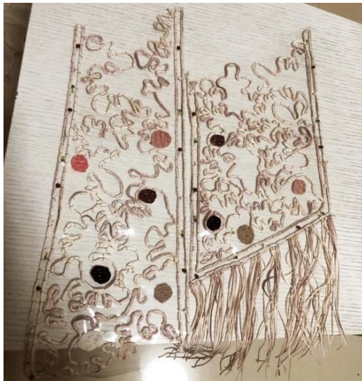
Fig.22: The pattern designed with TPU as the embroidery base by using the stitching process combined with corn rivets, beading and hematoxylin dyeing.