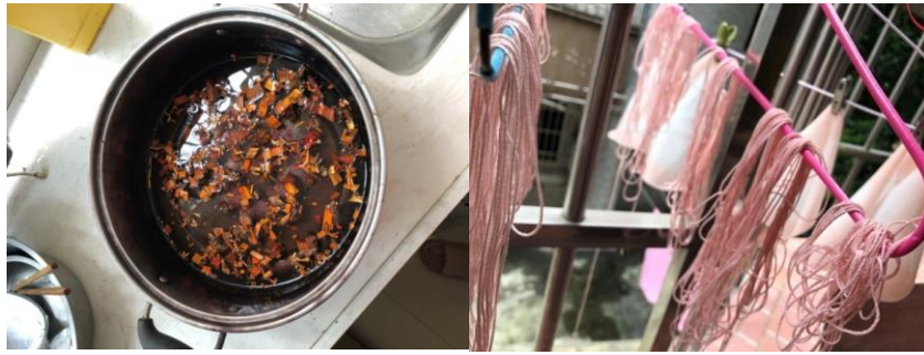
Figure.17 hematoxylin dye material